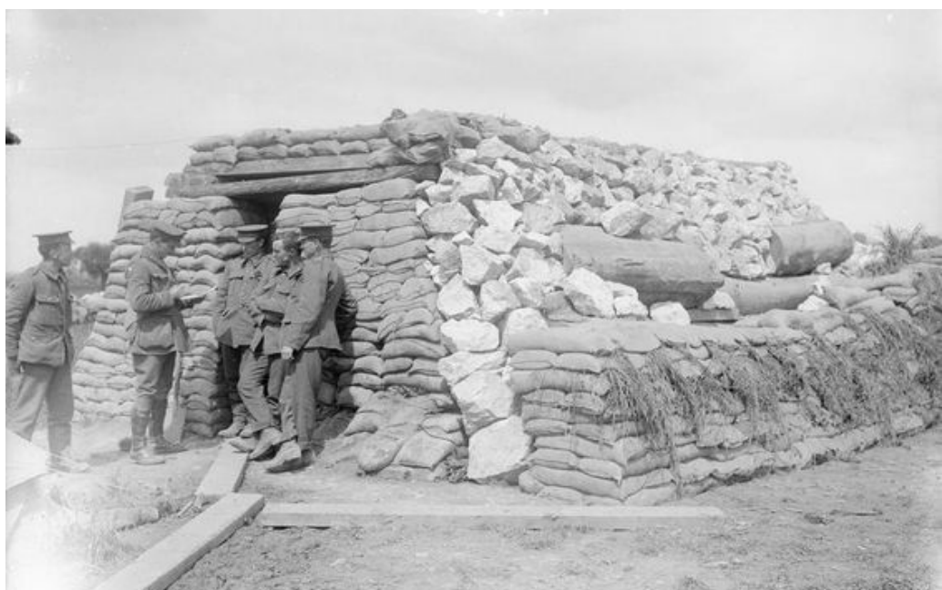
Gunnery of the Royal Garrison Artillery outside a bomb-proof dug-out at Reninghelst, 15th June 1916.