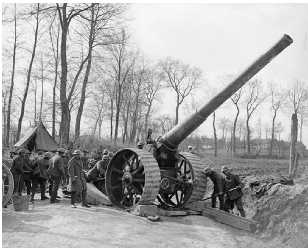
Mar 26 1918 "Battle of Rosières (Operation Michael). A 6-inch Mark VII gun of the Royal Garrison Artillery in action near Hédauville"

Normandiet , built by Hellerups Skibsvft. & Maskinbyg., Hellerup in 1902 and operated at the time of her loss by The Shipping Controller (Lambert Bros., Ltd.), London, was a 1,843grt, defensively-armed British Merchant Ship. On the 21st April 1918 when 34 miles SW by W from Calf of Man, (which is an island near the Isle of Man) when she was torpedoed without warning and sunk by German submarine U-91 when en route from Bilbao for Glasgow with a cargo of iron ore. 19 lives lost including the Master.